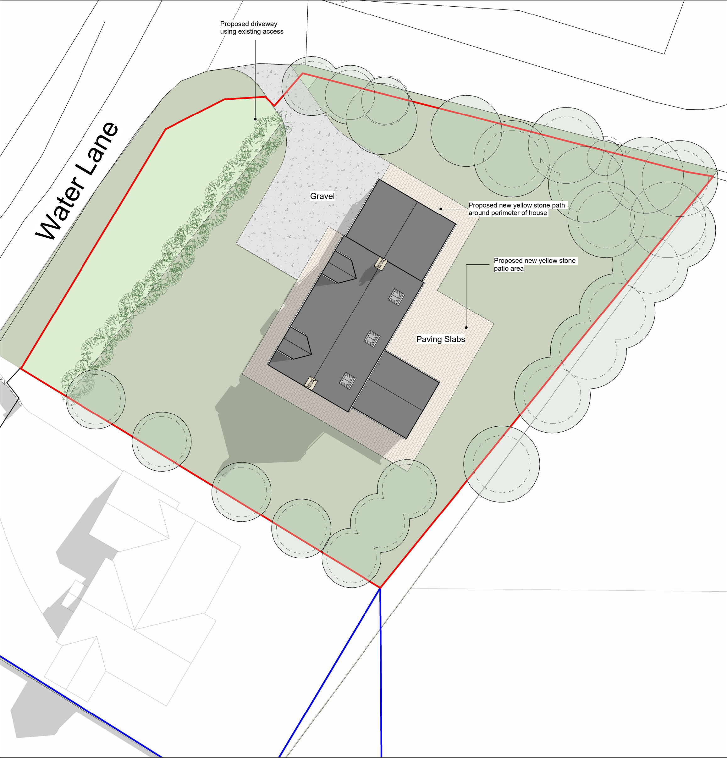
① P003 Site Plan 1 : 200